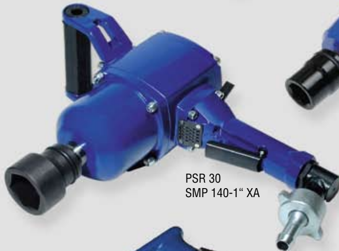
PSR 30 SMP 140-1" XA