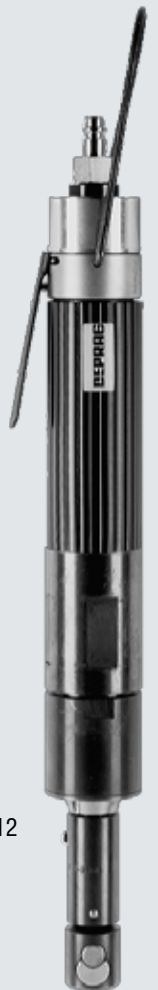
Model DS 070-003BXR16

The tapper model series „DP“ is primarily used for the tapping of threads into steel, aluminium and other alloyed materials. These tappers offer a cutting capacity of up to M14-threads into steel. To re-tap existing threads up to a size of M16, we offer two different designs: