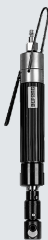
Model DS 040-007BXR12