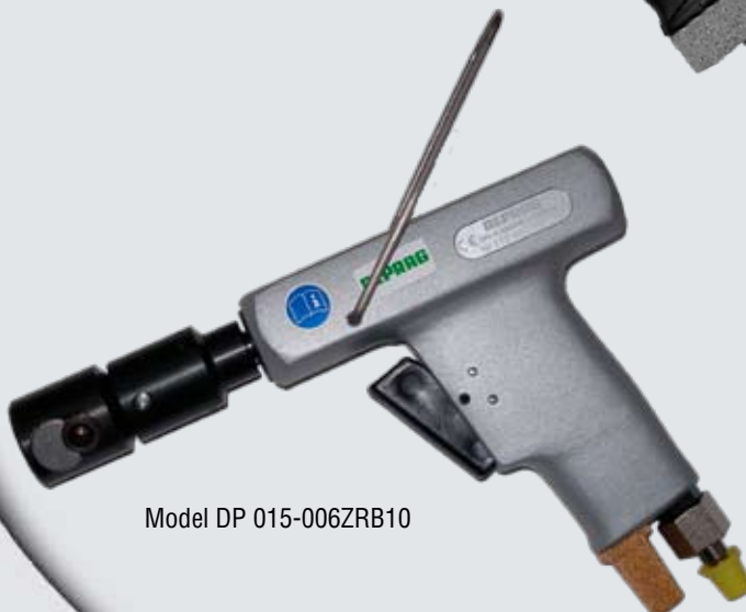
Model DP 015-006ZRB10