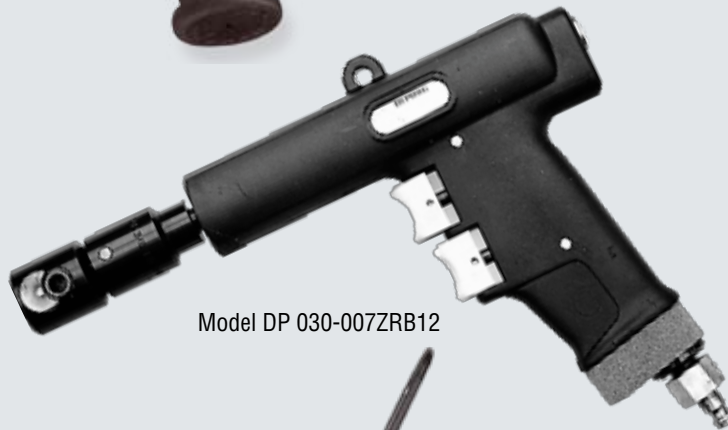
Model DP 030-007ZRB12